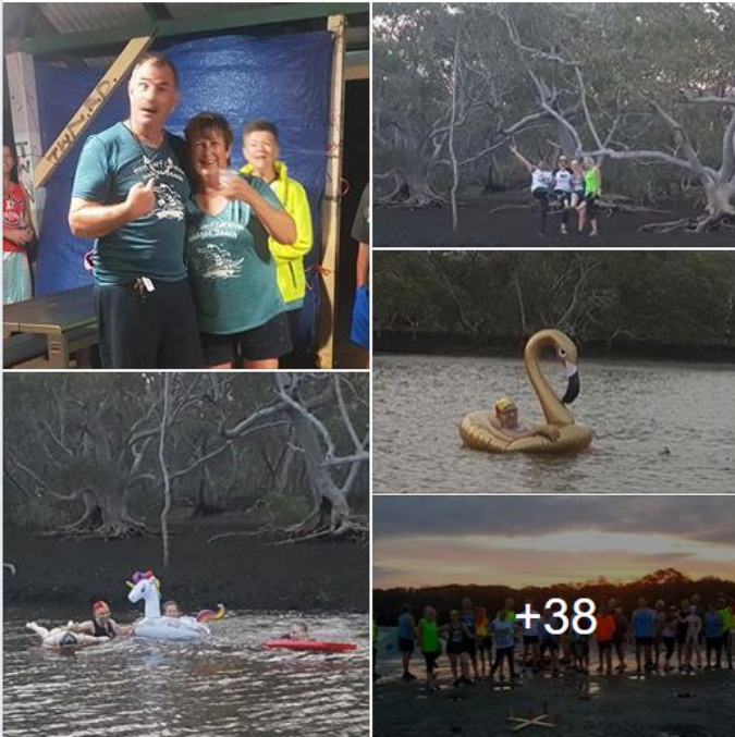
Last nights shernnanighans at the Nudgee Beach Surf club Carnival.