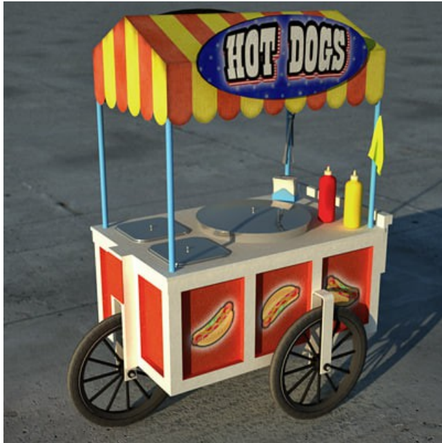
On On Food